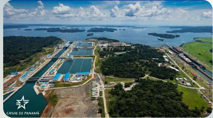
Panama Canal Expansion Program

He is currently on an expatriate assignment in Panama as the Deputy Program Manager and Geotechnical Eng'g. Expert/Advisor for the Panama Canal Expansion Program - a project that has been listed as one of the World's Top 50 projects in the last 50 years.