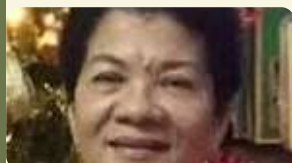
President's Corner MSUAA president shares her thoughts -page 3