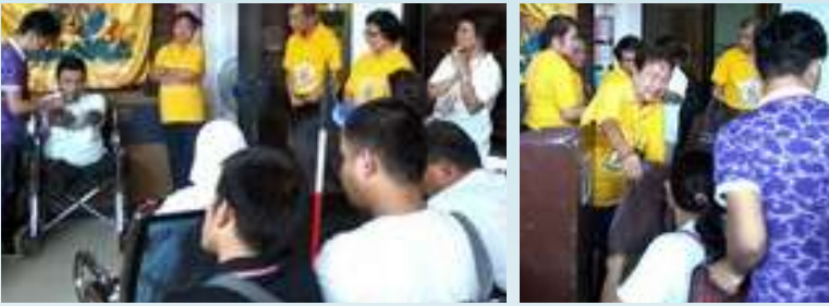
LOVE DRIVE FOR PWD'S