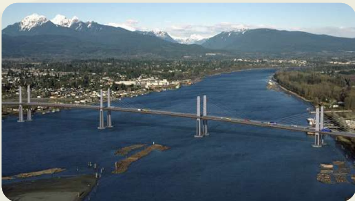
Golden Ears Bridge Project, British Columbia, Canada

As a Geotechnical Eng'g. Expert and Consultant, he has about 27 years of international consulting, design, construction, and management experience on more than 150 civil infrastructure and mining projects across the United States, Canada, and Latin America. Among these are the following award-winning Mega Projects: Panama Canal (considered as one of the greatest Civil Engineering achievements of all time and one of the Seven Wonders of the modern world); Cobre Panama Copper Mine (Latin America); Golden Ears Bridge (Canada); Marquette Interchange (Wisconsin, USA); Whittier Access Bridge (Alaska, USA); Hanford Nuclear Plant (USA); and Sound Transit Link Light Rail (Seattle, USA).