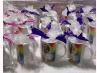
Last February 16, 2021, in celebration of the Integration Day of MSU Maigo to the MSU System, the MSU Alumni Association Maigo Campus Chapter launched its revenue generation project dubbed as the Alumni Corner. On sale are souvenir items bearing the MSU Alumni Association Logo.

Life's persistent and most urgent question is, What are you doing for others? -Martin Luther King Jr.