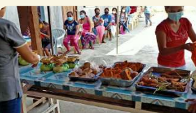
Chapter Activities MSUAA Chapters making a difference amid the pandemic -pages 9 & 10